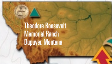
Theodore Roosevelt Memorial Ranch Dupuyer, Montana